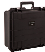
U5771A Rugged carrying case, hard