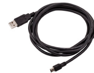
U5762A USB standard-A to mini type-B interface cable, 1 m