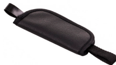
U5772A Hand strap, adjustable for right-handed and left-handed use