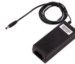
U5751A Power adapter (with power cord)