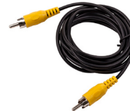
U5761A Video RCA to RCA interface cable, 2 m