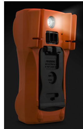
Figure 2. The built-in flashlight as illustrated