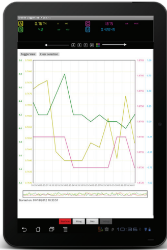
Figure 4. Data logging with Keysight Mobile Logger software.

Data logging is an important function for industrial users to capture data streams or plotting trending graphs. These data and graphs are used for analysis to identify intermittent behavior or detect drifts. Keysight Mobile Logger is the free Android application software that logs data and provides trending graphs from Keysight handheld digital multimeters. Keysight Mobile Logger offers an array of extended functions such as sending e-mail or Short Message Service (SMS) automatically, and pan and zoom function via the Android device's touch screen. Alternatively, data logging and monitoring activities can also be performed at the comfort of one's Personal Computer (PC) via a downloadable Keysight GUI data logger software.