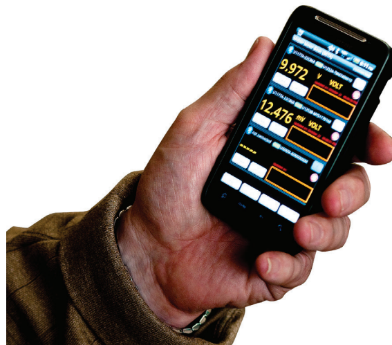
Figure 6. Make measurements with the Keysight Mobile Meter via an Android smart phone

Keysight Mobile Meter is a free Android application software that allows an Android device to connect, control and perform up to 3 multimeter measurements. Without the need to be physically present at various points, users can now extend their reach to two or three places. This solution allows you to make measurements from a safe distance, eliminates the need to walk back-and-forth between measure target and control points, and monitors multiple measurements simultaneously. Achieve higher work productivity when you use the U1177A with your Keysight handheld digital multimeters.