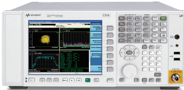
Figure 1. The new 26.5 GHz CXA X-Series signal analyzer

Essential Signal Characterization Now Up to 26.5 GHz