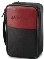
U1174A Soft carrying case