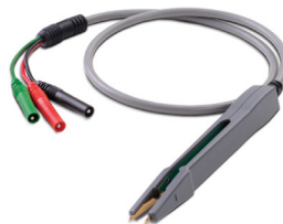
U1782A SMD tweezer