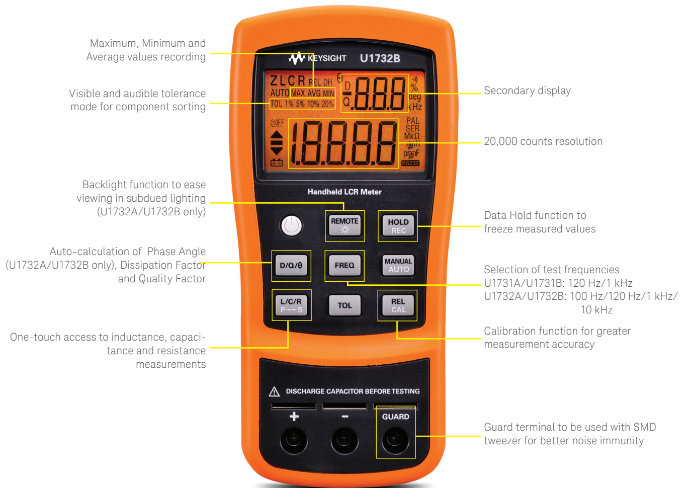
Figure 2: U1732B front view