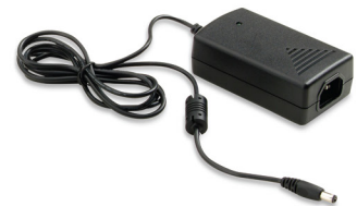
U1780A Power adapter and cord (according to country)