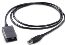
U5481A IR-to-USB cable