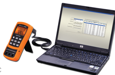
Figure 1: Automate the recording of continuous readings when you hook the U1731A/U1731B/U1732A/U1732B to a PC