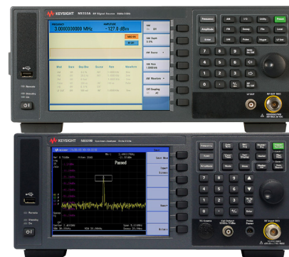
N9310A RF signal generator

Keysight low-cost RF solution – Built to perform, priced to compete