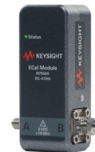
N7550A Economy ECal module for fast and easy calibration