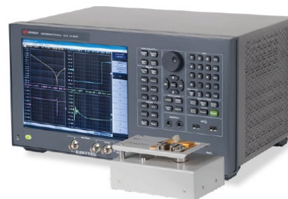
16091A terminal adapter and 16092A 7-mm test fixture

For more information about how to select impedance test accessories, refer to E5061B impedance analysis data sheet: http://literature.cdn.keysight.com/litweb/pdf/5990-7033EN.pdf