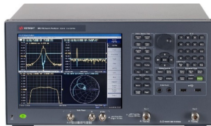
LF-RF NA Options (Opt.3L3/3L4/3L5)