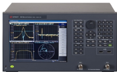
RF NA Options (Opt.115,215,135,235,117, 217,137,237)