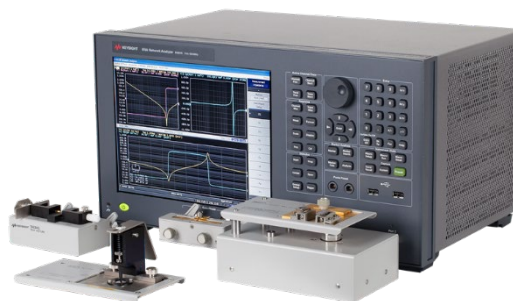
Compatible with a wide variety of test fixtures (Opt. 3L3/3L4/3L5)