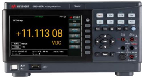
Figure 1. Keysight DM34460A/61A 6.5 digits dual-display digital multimeters

Keysight's DM34460A Series Truevolt Digital Multimeters (DMMs) provide reliable measurements with high levels of accuracy, speed, and data security. The Truevolt technology enables you to measure with confidence by eliminating power lines and environmental noise, ensuring precise measurements and providing responsive operation.