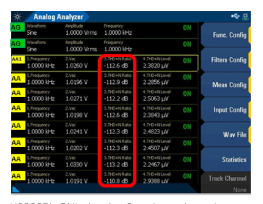
U8903B's GUI, showing 8 analyzer channel measurements