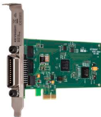
82351B with standard profile bracket