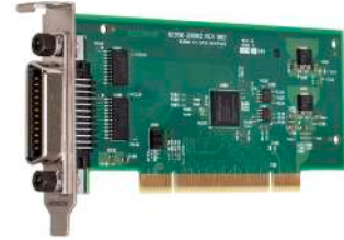
82350C with low-profile bracket