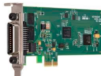
82351B with low-profile bracket