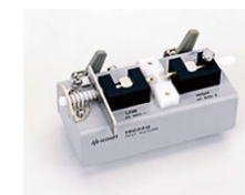
16034G SMD test fixture