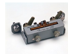
16047E test fixture