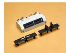
16047A test fixture