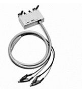
16089B Kelvin clip lead