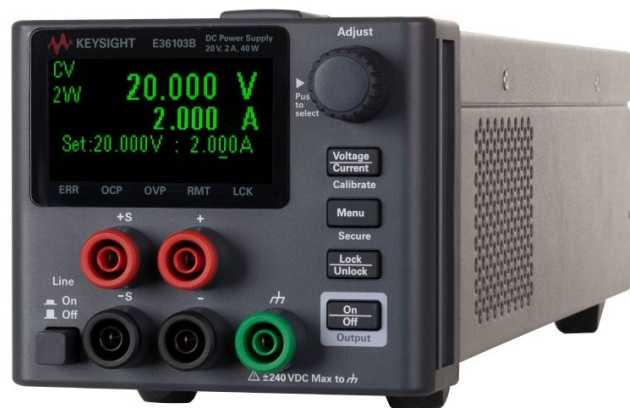
Option J01 recessed binding posts

Do you need to convert the power supply for different mains power? The two switches on the bottom of the instrument make it straightforward. See the product manual for details.