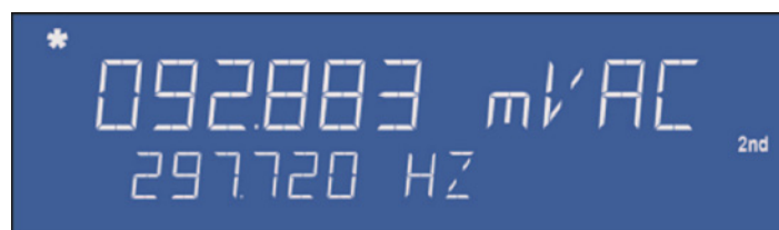
Figure 4. Dual display showing AC voltage and frequency.

Now the display should show the AC voltage reading in the primary display and the frequency reading in the secondary display. See Figure 4 .