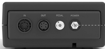
MSE Electric Desoldering Module

SCH Cartridge Holder ..... 1 unit Ref. SCH-A