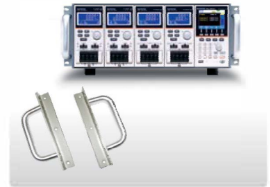
PEL-003 Panel Cover