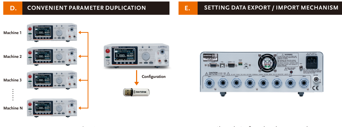
Export/Import of Setting Parameters

displayed simultaneously, hence, users can easily obtain complete information without switching the screen or connecting an external counter. In addition, AUTO mode also supports tabular testing, which greatly improves the convenience of observation.