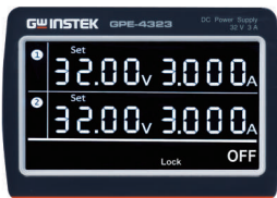
4.3 Inch LCD display provide high resolution for 10mV/1mA

The GPE-X323 series features 10mV/1mA high resolution (for setting and read back). The series outputs a pure and stable power supply. Users can easily simulate small voltage or small current measurements for DUTs that is the area the conventional low resolution linear power supplies can't achieve.