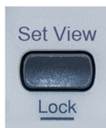
The key lock function prevent DUTs from unnecessary damages caused by mis-operation.

The GPE-X323 series has a built-in set view and key lock so as to expedite the operation process. The key lock function protects DUTs by preventing others from changing voltage/current parameters.