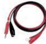
9615-01 H.V. TEST LEAD (red: high voltage side) 9615-02 H.V. TEST LEAD (black: return side)