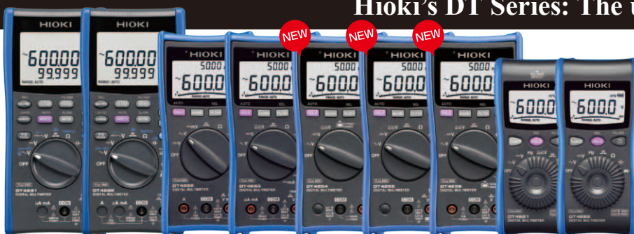
DT4281 DT4282 DT4252 DT4253 DT4254 DT4255 DT4256 DT4221 DT4222

HioKI's DT Series: The ultimate line of digital multimeters