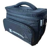
HM-SP01-POUCH M/G/SP Series Pouch