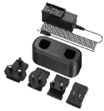
HM-5202ZC2 G Series Charging Base