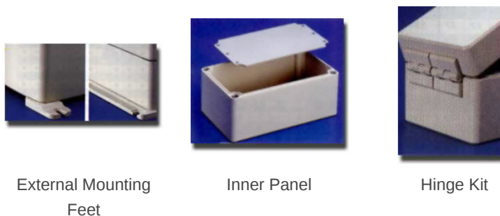
External Mounting Feet