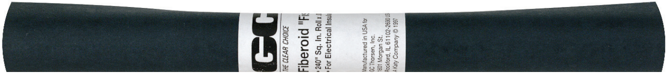
Fig. 1 Note: 0.01" ±10% Thickness