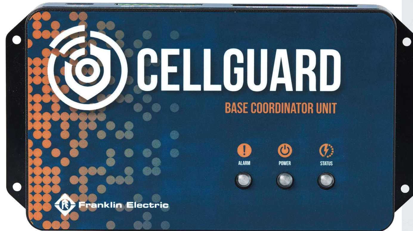
BASE COORDINATOR UNIT

The user can set / modify many measurement parameters and thresholds either locally or remotely. The system invokes a permission hierarchy to manage administrative access.