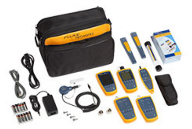
FKT1475 Complete Fiber Verification Kit