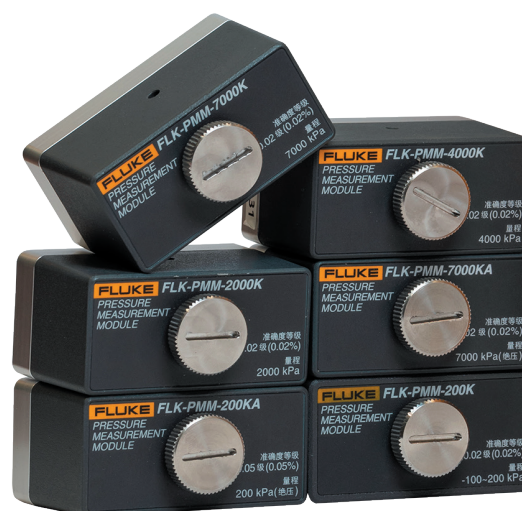
Figure 1. Rechargeable lithium battery with capacity indication.

HART communication enables mA output trim, trimmed to applied values, and pressure zero trimming of HART pressure transmitters. You can easily change a transmitter tag, measurement units and ranges. Other supported HART commands include setting fixed mA outputs for troubleshooting, reading device configuration parameters and reading device diagnostics.