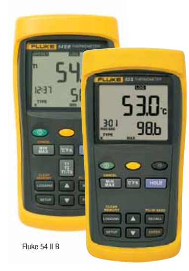
Fluke 53 II B