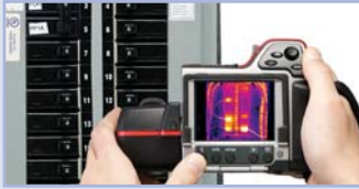
Infrared cameras quickly locate problems with electrical equipment

METERLiNK frees the Thermographer from the manual process of collecting field data