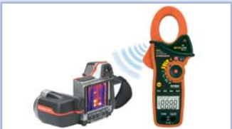
Manual data collection results in unnecessary complexity and risk. METERLiNK eliminates this problem by allowing the thermographer to quickly take a current reading on an electrical target and associate those readings with the corresponding targets stored in an infrared image