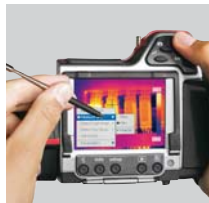
Multifunction Touch Screen