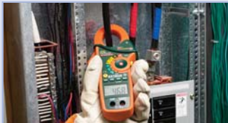
Collecting current measurements and associating them with the right component identified on an infrared image, can be a complicated and cumbersome process