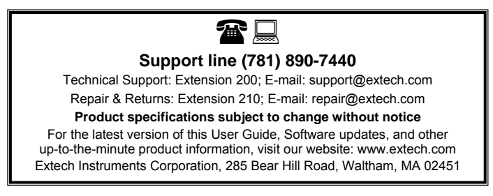
Copyright © 2007 Extech Instruments Corporation

Extech offers repair and calibration services for the products we sell. Extech also provides NIST certification for most products. Call the Customer Care Department for information on calibration services available for this product. Extech recommends that annual calibrations be performed to verify meter performance and accuracy.