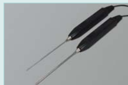
881603 and 881604 immersion probes