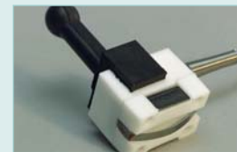
881616 surface probe