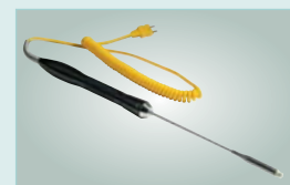
881602 surface probe