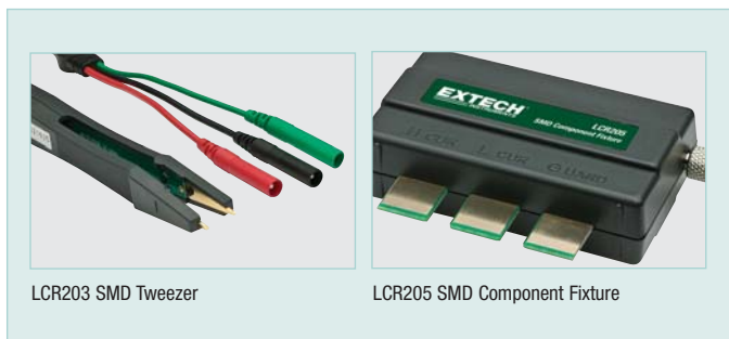
LCR203 SMD Tweezer