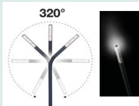
Articulating (6mm diameter) camera tip adjusts up to 320° viewing angle with four built-in bright LED lights illuminate dark areas