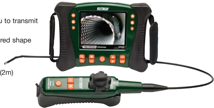
Includes Wireless transmitter, SD memory card, 3.7V rechargeable Li-Polymer battery, patch cable, AC adaptor, USB and AV cables, 6mm articulating camera tip with cable, and hard carrying case