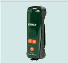
Includes Wireless Transmitter for remotely viewing images or video on the borescope display (distance up to 100ft./30m from measurement location)