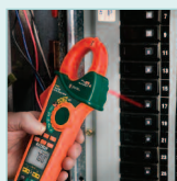
Built-in IR Thermometer for quick and safe non-contact temperature measurements. Find hot spots fast!