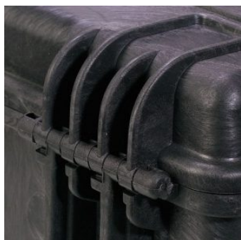
CORROSION PROOF METAL HINGES WITH LID STAY FEATURES