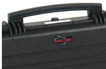
LARGE FRONT HANDLE

Internal slots for optional panel mounting brackets or panel mounting rings