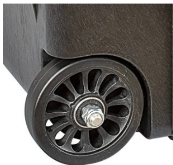
SELF OILING FREE RUNNING WHEELS