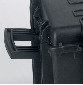
TWO MAN LIFT SIDE HANDLES