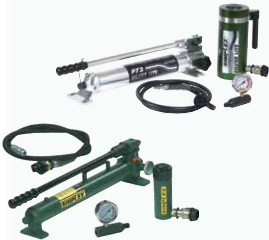
ST106A Set Shown