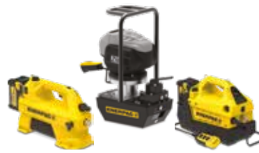
Cordless Hydraulic Pumps