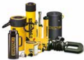
Cylinders & Lifting Products