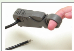
Rotate for wire stripping