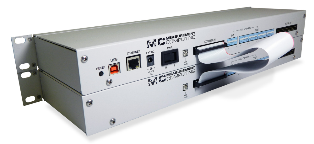
The TC-32 can connect to an Ethernet or USB port. Both the TC-32 and TC-32-EXP include 50-pin connectors that provide access to all DIO channels. Adding the TC-32-EXP expansion device doubles the channel count of the system.

All alarm mode settings can be configured with <u>InstaCal</u>.