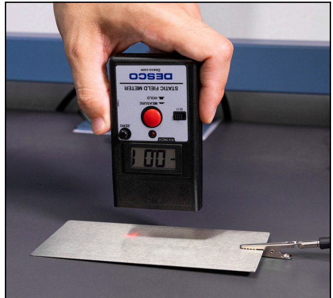
Figure 6. Pointing the Digital Static Field Meter to a grounded surface

Slide the power switch to the right to power the Digital Static Field Meter. Point the top of the Digital Static Field Meter approximately 1 inch (2.5 cm) away from a grounded metal surface. Proper spacing is indicated when the two red bullseyes emitted LED range indicator become centered on top of each other. Turn the rotary zero knob until the Digital Static Field Meter's display reads 0.00.