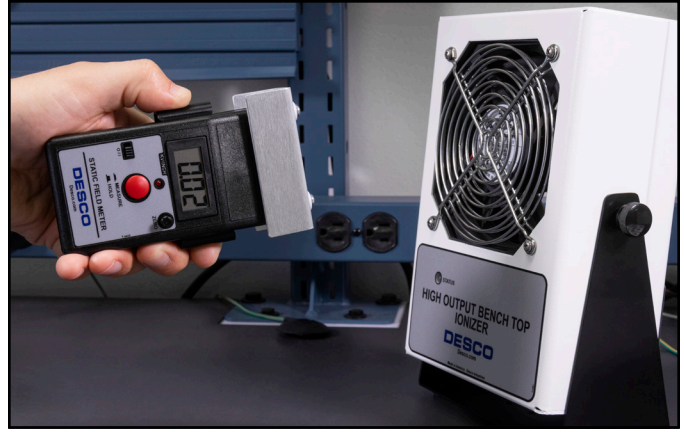
Figure 9. Using the Digital Static Field Meter with Conductive Plate to measure the offset voltage of a benchtop ionizer

NOTE: When testing pulsed ionizer systems, the voltage displayed is constantly changing. This pulse rate may be faster than the display update rate of the Digital Static Field Meter, therefore the displayed voltage is an average of the actual voltage. The output of the Digital Static Field Meter is useful in this situation for more accurate measurements.