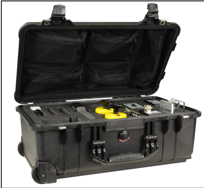
Figure 1. Desco 19790 ESD Survey Kit