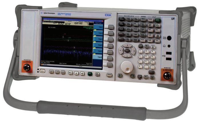
Portable configuration includes pivoting carrying handle and protective corner rubber guards (front protective cover comes standard) – N9000A-PRC