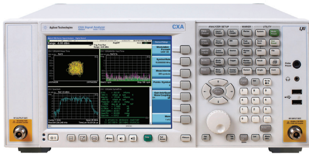
CXA bench top configuration