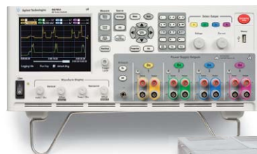
Agilent N6705A DC power analyzer