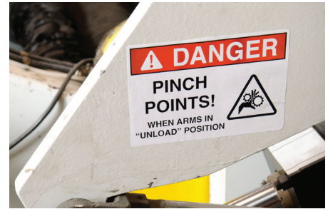
Safety and Facility ID