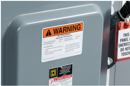
Arc Flash Labels

With a variety of possible color combinations, you can easily create identification labels for every area in your facility, including: