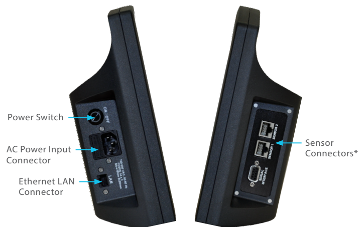
MODEL 4421A Side Views

The 4421A is the next generation replacement for the industry standard Model 4421. Building upon the original model's high level of accuracy and its ease of use, the new 4421A enhances the meter's functionality by utilizing a smaller/lighter design, and by providing the ability to have dual sensor inputs.