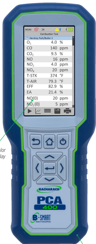
Large color touch display