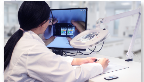
Inspect Through a Monitor & Magnifying Lens