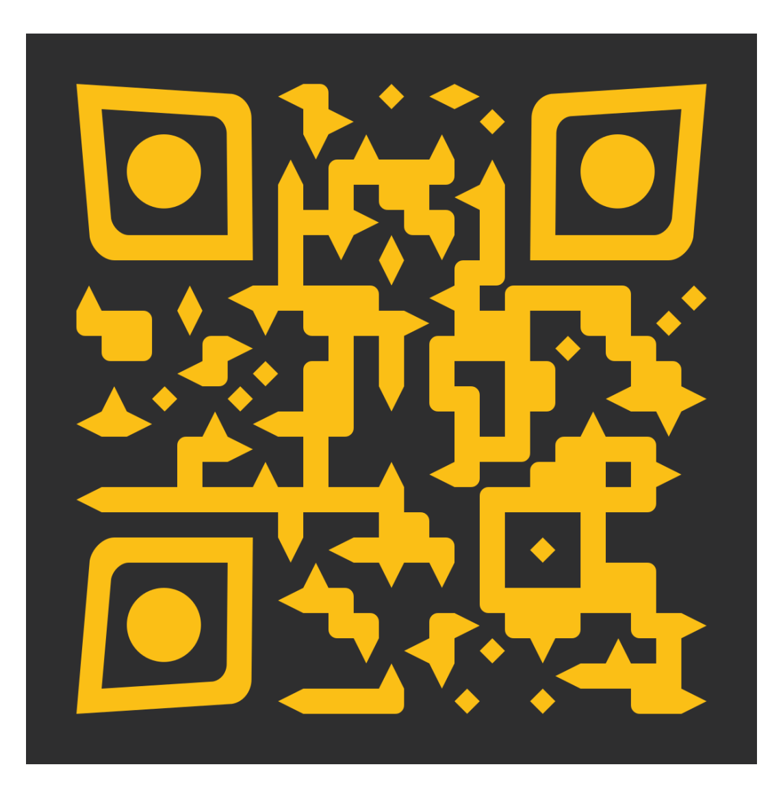
Scan to view video