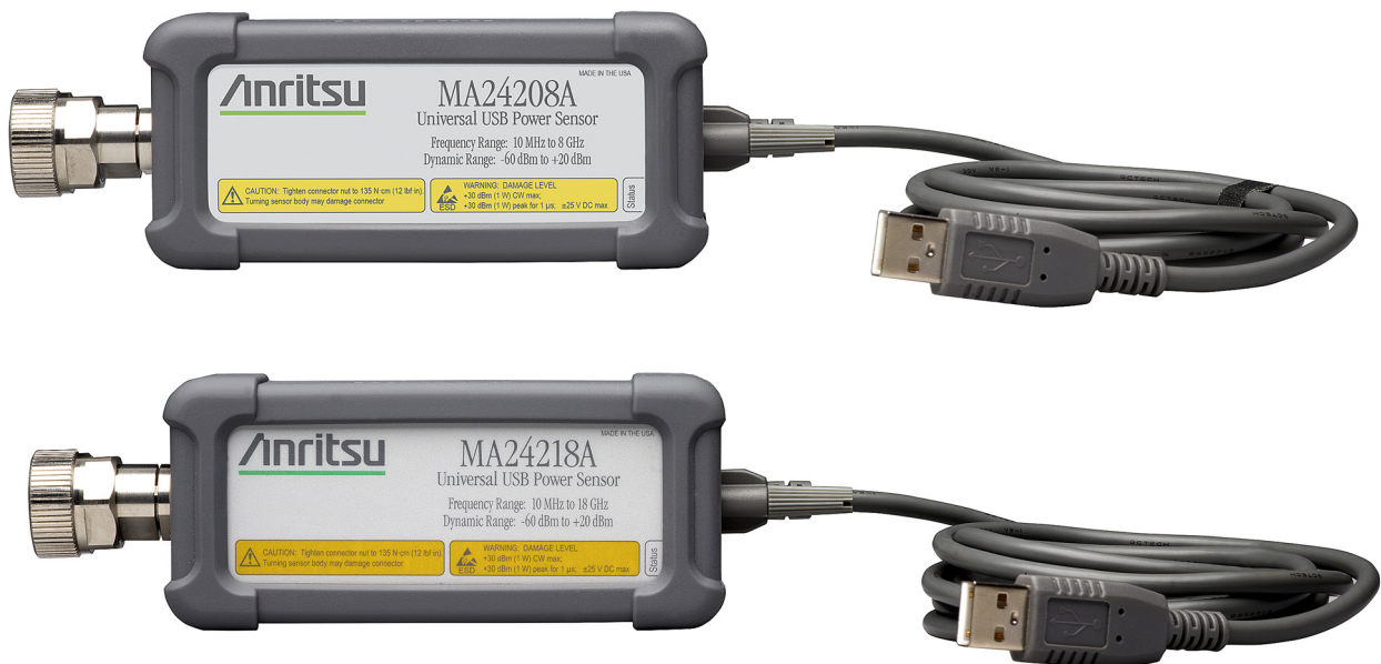
MA24208A and MA24218A Universal USB Power Sensors