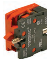
S4 Normally Closed Gold plated