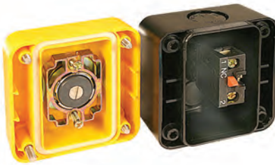
Plastic Enclosure with base mount contacts and metal operator