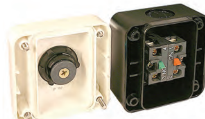
Plastic Enclosure with base mount contacts and plastic operator

* For use with non-illuminated operators in thermoplastic or aluminum enclosures listed on page 30 and 36.