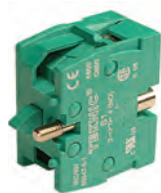
S1 Normally Open Silver