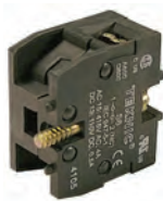
S6* Normally Closed Silver