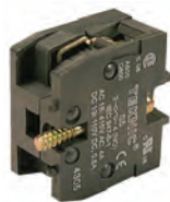
S5* Normally Open Silver