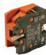
S8* Normally Closed Gold plated