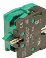
S3 Normally Open Gold plated