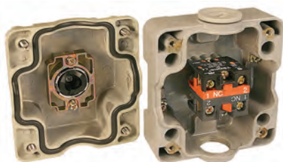
Cast Aluminum Enclosure with base mount contacts and metal operator