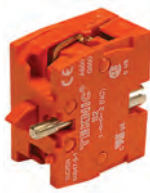
S2 Normally Closed Silver