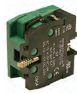
S7* Normally Open Gold plated